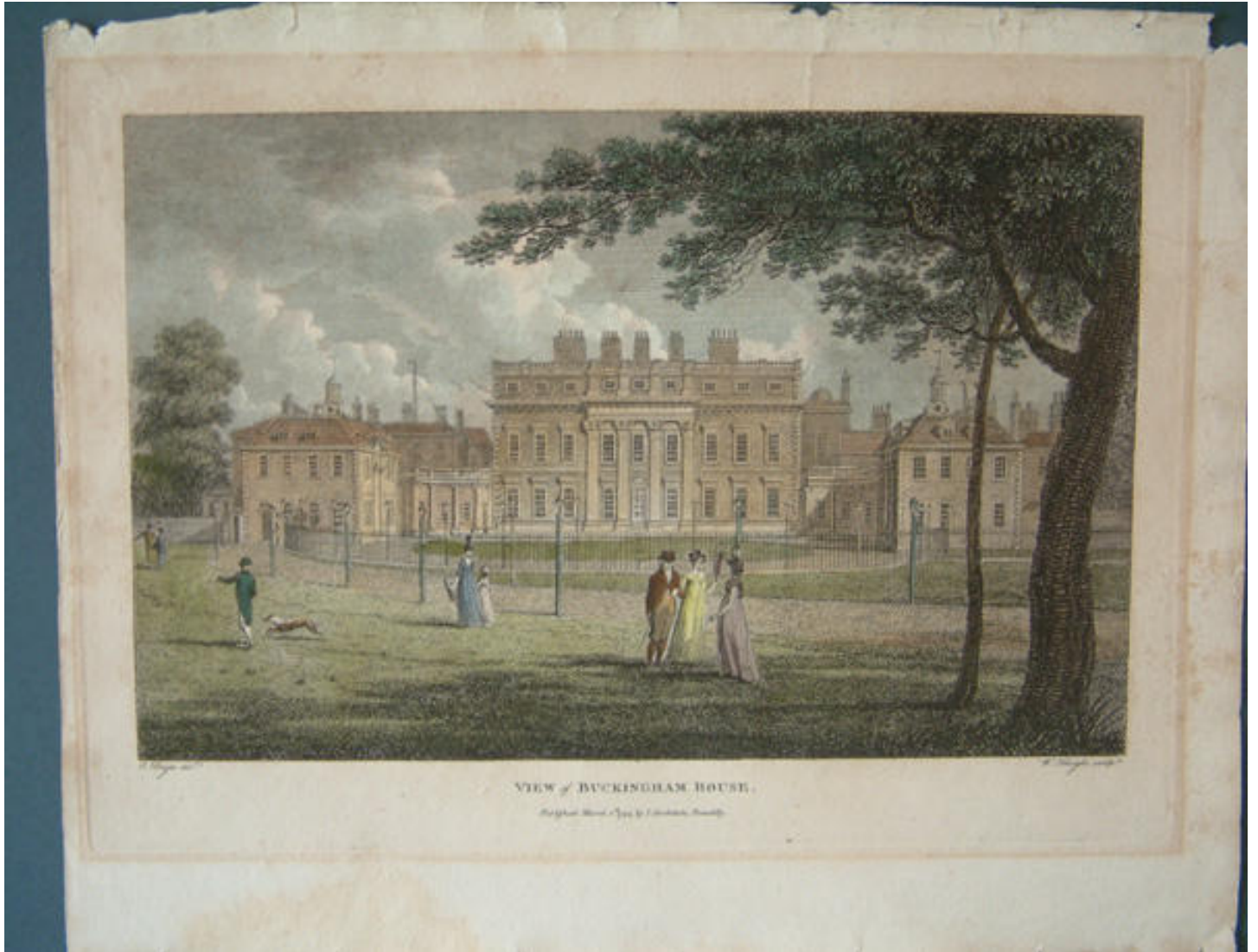
VIEW of BUCKINGHAM HOUSE. Engraved from a Picture by E. Dayes.